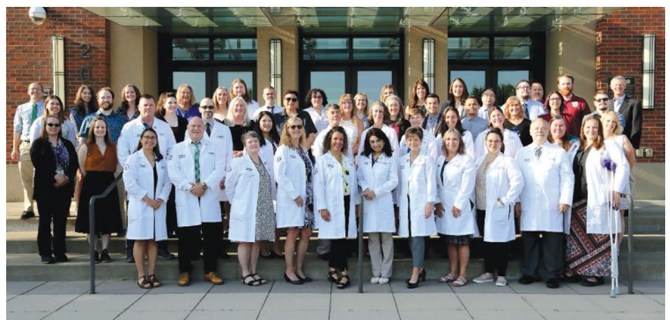
Faculty and staff at COMP-Northwest 2022

Fourth year student update: Deep in their rotations, DO2023 students are finalizing their interviews to secure a spot in their desired residency. In the past four years, 295 students (>25%)